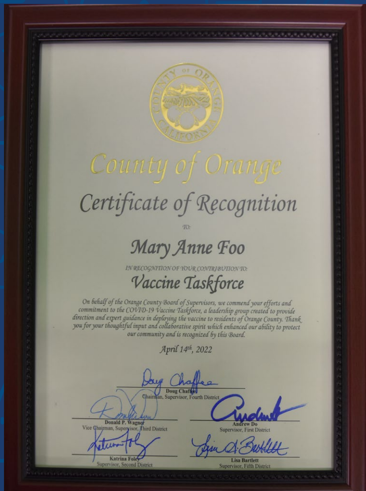
Certificate of Recognition presented to members of the COVID-19 Vaccine Taskforce.