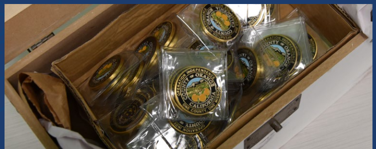
County of Orange "Operation Independence" coins which were presented to members of the Vaccine Taskforce.